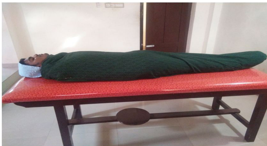
Figure 1: Cold wet sheet pack