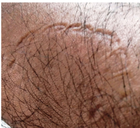
Figure 2: A cutaneous human bitemark reveals a representational pattern of the dentition.

Cutaneous Human Bitemark: An injury in skin caused by contacting teeth (with or without the lips or tongue) which shows the representational pattern of the oral structures (Figure 2).