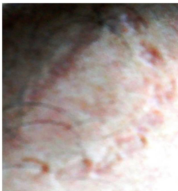
Figure 1: Bite marks on right arm of a rape victim

Bite marks defined as, a physical alteration in a medium caused by the contact of teeth. A representative pattern left in an object or tissue by the dental structures of an animal or human. Bite marks occur primarily in sex-related crimes, child abuse cases, and offenses involving physical altercations, such as homicide [1]. Male victims are most often bitten on the arms and shoulders, while female victims are most commonly bitten on the breasts, arms and legs [2]. Figure 1