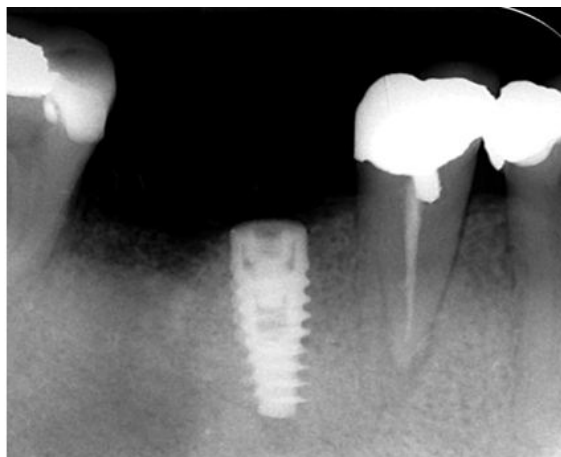
Figure 5: A new implant in different location after a month

4 months post implant placement, he was seen and reported no symptoms and, in fact, "felt great." At that time, a straight abutment was placed, the retaining screw tightened to 35 Ncm and slightly prepared and impressed for a full crown cemented restoration. A provisional acrylic crown was placed. A porcelain-fused to noble alloy crown was cemented 6 weeks later and made to avoid any centric or eccentric contacts, as was the position of the natural tooth. The crown was cemented with zinc oxide and eugenol paste (Opotow) and then, 4 months later, with zinc oxide and eugenol cement. No signs or symptoms of infection were noted. A panoramic radiograph showed radiographic resolution of the apical lesion (Figure 5). The patient had no symptoms at this time and there were no signs of infection.