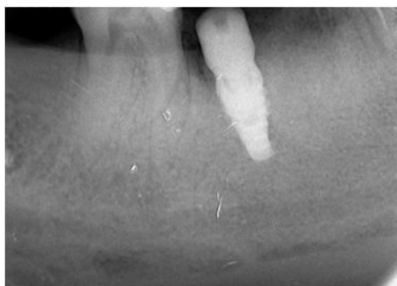
Figure 2: Implant in distal root region of tooth 46 site

Local anesthetic (20 ml Prilokain % 2) was infiltrated and the tooth was atraumatically extracted and the socket was curetted. In distal root region of tooth, the bone volume was good for implant treatment. A full-thickness flap was raised and an osteotomy prepared by first marking the site with a #6 round burr, then drilling the site in sequence with 2-mm, 2.8-mm, and 3.5-mm drills. All these were internally irrigated with normal saline. All drills were used at 800 rpm. Misch bone type D-2 was encountered [15]. A 3.75-mm diameter and 11.5-mm length (Tidal Spiral Implant, Implant Innovations Inc, The Picasso Building, Caldervale Road, Wakefield, West Yorkshire) was placed into the full length of the osteotomy (Figure 2). The insertion torque was more than 35 Ncm. The site was primarily closed with 4-0 Vicryl (Ethicon). Postoperative was given antibiotics (Amoxicillin/Clavulanate potassium 1000 mg tablets BID) and NSAI drug (Naproxen sodium 550 mg tablets) every 12 hours for 5 days and a chlorhexidine oral rinse (Klorhex). The sutures were removed 1 week later, and the site had healed well. The patient was reappointed in 6 months for evaluation of the site.