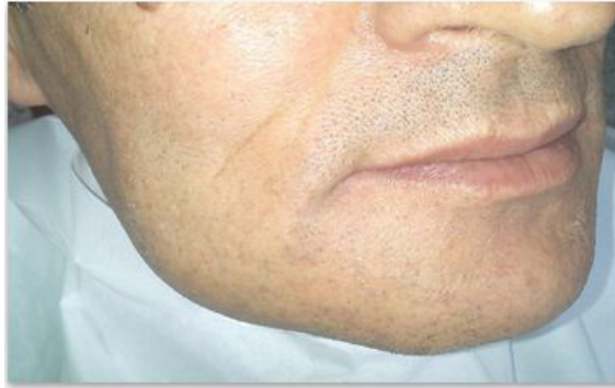
Figure 3: Slightly swelling in right cheek of patient