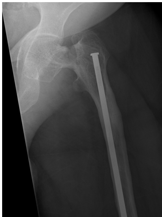
Figure 1: AP radiograph Left hip taken at initial presentation to our institution with femoral neck fracture and incomplete AFF in the presence of previously placed growing femoral rods

left lower extremity for 6 weeks was elected for treatment. After 6 weeks, he sustained a muscle spasm while lying in bed, resulting in immediate pain in his left hip. Radiographs demonstrated a displaced femoral neck fracture as well as a proximal femur stress fracture in the presence of IM growing rods (Figure 1). He was subsequently transferred to our institution for further management. Home medications upon arrival include alendronate 35 mg once weekly.