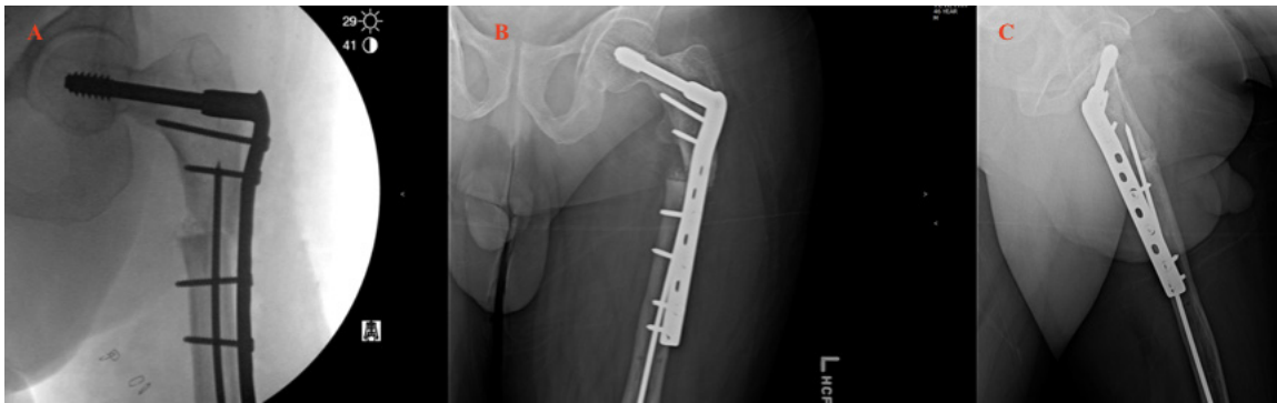
Figure 3: (a) intra-op radiographs osteotomy of fracture site, removal of deep hardware in femoral neck, and removal of proximal aspect of growing rod; (b-c) AP and lateral radiographs at first follow up

At one-year postoperatively, he continued to have minor residual left hip pain and low back pain. He was able to return to his activity of choice, bowling, but with significant start-up pain. At last follow up, he was ambulating unassisted and balance is without issue. Radiographs demonstrate healing at the osteotomy site with DCS in an unchanged position (Figure 4a and b).